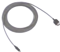
CCFD-3L (4-pin to 6-pin with lock) CCF-3L (6-pin to 6-pin with lock) i.LINK Cable