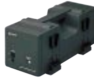
BC-L100 Battery Charger