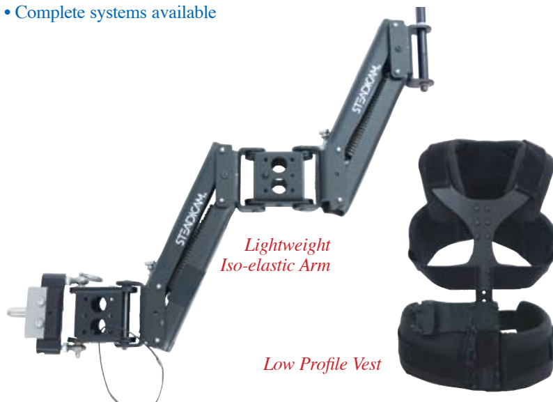
Low Profile Vest