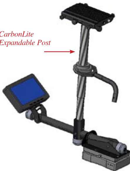
CarbonLite Expandable Post