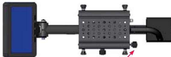
Stage Plate has X-Y Vernier Adjustment.