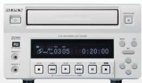
DVO-1000MD Medical DVD Recorder