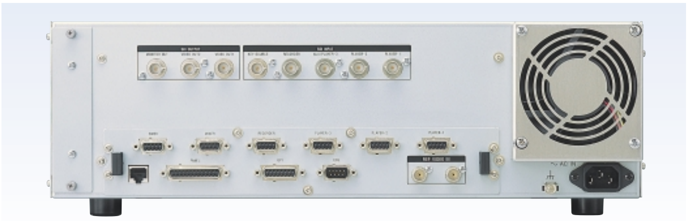
Rear Panel of BVE-700 Processor Unit