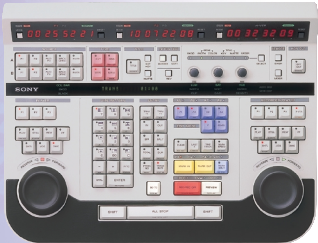
BVE-700 Control Panel

In addition to 1080/24P, the switcher can also operate on 60, 59.94, 50, 30, 29.97, 25 and 23.97 Hz frequencies to accommodate the different demands in HD production.