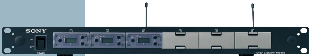
Photo shows tuner module installed in the MB-806A.