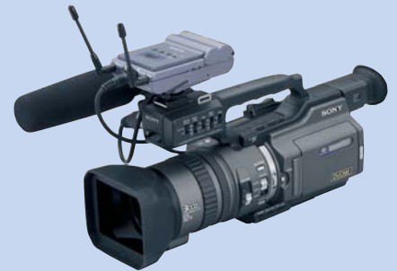
Photo shows portable tuner mounted on a DSR-PD150P.