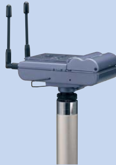
Photo shows portable tuner mounted on a microphone stand.