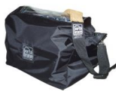
QSA-2 Audio Quick Slick