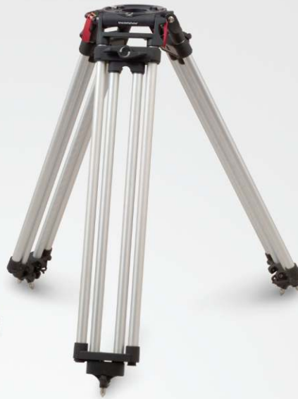
CINE HD ALUMINUM

Capacity = 60 lbs (27.2 kg) Max Height = 66 in. (167.6 cm) Min Height = 14.75 in. (37.5 cm)