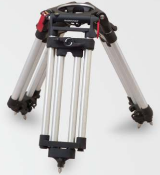
CINE HD BABY

Capacity = 309 lbs (140 kg) Max Height = 69.2 in. (175.8 cm) Min Height = 33.6 in (85.3 cm)