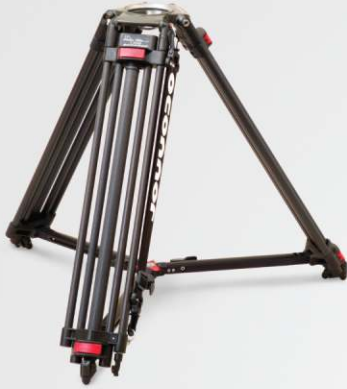
35L CARBON FIBER QUICK DEPLOYMENT TRIPOD

Capacity = 60 lbs (27.2 kg) Max Height = 62 in. (157.5 cm) Min Height = 26 in. (66 cm)