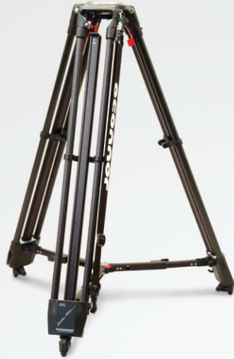
25L CARBON FIBER TWO STAGE TRIPOD

Capacity = 60 lbs (27.2 kg) Max Height = 62 in. (157.5 cm) Min Height = 26 in. (66 cm)