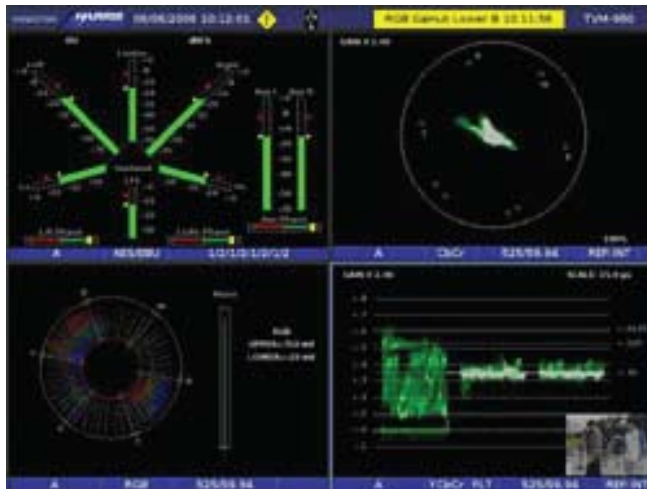
Q-SEE technology allows complete display versatility

The TVM9150PKG features Harris Corporation's patented Q-SEE™ display technology, which enables users to configure their screen for any specific need. Whether the desire is for full screen, quadrant with picture thumbnail or the convenient MULTI mode, Q-SEE can make it happen. Choose from waveform, vector, gamut, audio, picture and timing displays, and place each in any quadrant on the screen.