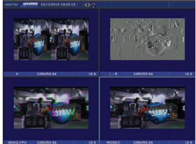
TVM9150 with four different pictures of 3D input

The newest advances in 3D testing are available in the TVM9150PKG. The new VPR 50 board enables the display of up to four 3D pictures or a combination of multiple 3D pictures and/or waveforms, including the ability to display separate left-eye and right-eye pictures and waveforms simultaneously. 3D testing capability requires the TVM-VTM-3D option (for those owners of the TVM9100PKG or TVM9140PKG, the upgrade path is with the TVM-50F).