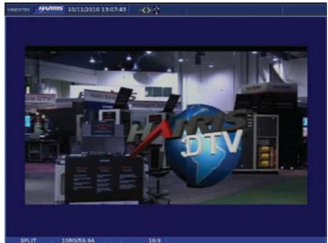
Split picture display

The Split picture display is useful for locating vertical misalignment of a stereo camera pair and focus differences between left and right inputs. The split location is adjustable across the picture, allowing the user to select the overlap location for determining the best place for alignment.