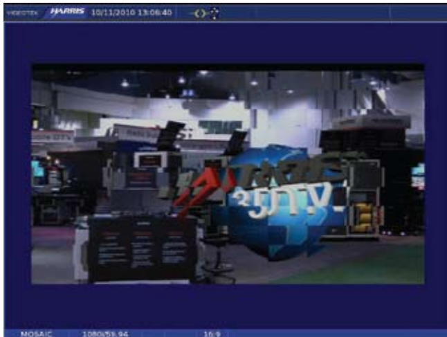
Mosaic picture display

The Mosaic picture display is useful for catching differences in color/brightness of the left and right sources. For example, on a surface containing a basic, constant color — such as a wall, a field or the sky — if the two cameras are matched for color brightness, contrast, etc., the mosaic pattern is not visible; if the cameras are not matched, the mosaic pattern is easily visible. Also, adjacent mosaic “boxes” will look more mismatched for parts of a scene containing greater 3D depth. The unit has a vertical and horizontal adjustment for the mosaic block size, allowing the user to select the optimum block size for making deterministic evaluation of the signal.