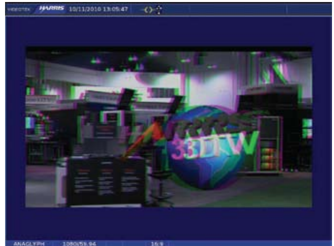
Anaglyph picture display