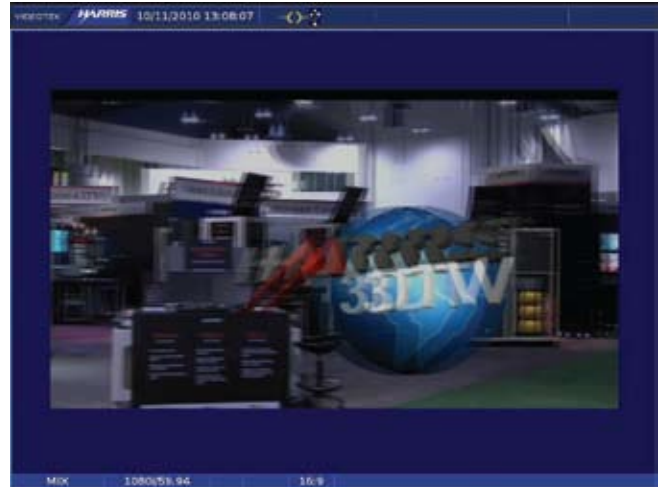
Mix picture display

The Mix picture display feature shows a 50/50 mix of the A and B inputs. This mode is useful for seeing both left and right views superimposed on each other, and therefore instantly highlights the parts of the scene that have greater 3D depth than others. This view is achieved by performing a 50 percent mix of the red, green and blue components of the left and right image pairs.