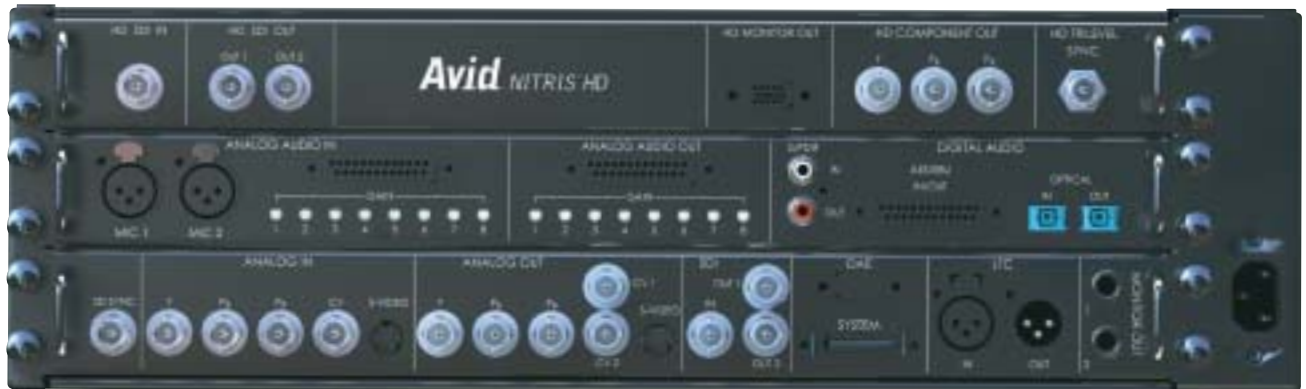
Avid DS Nitris features a broad range of professional input/output connections, including analog video and audio